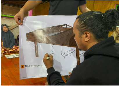
Phase 1: Co-creation